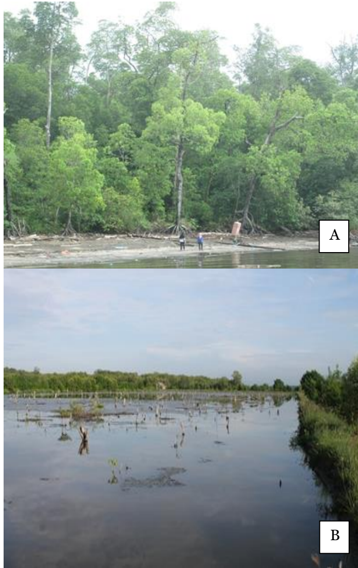
Figure 1. Primary mangrove forest (A) and fish pond active (B) in SNP South Sumatra.

communication). Mangrove condition from each former pond can be seen in Figure 3.