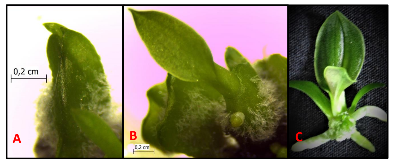
Figure 3. Further development of somatic embryo Phalaenopsis sp. A. Protocorm like bodies germination, B. Protocorm like bodies with leaf, C. Planlet.