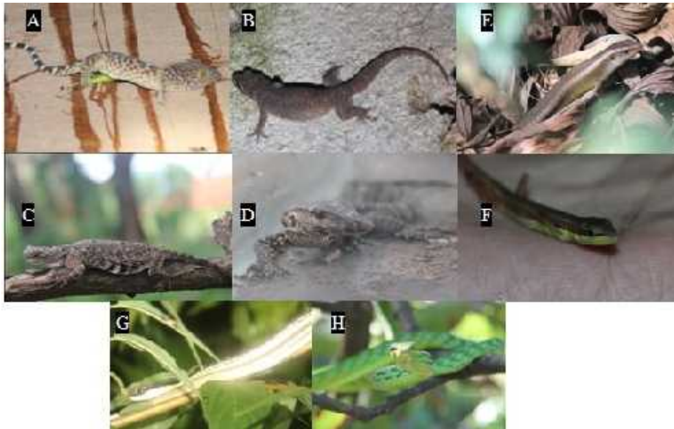
Figure 4.2. (A) Gekko gecko . (B) Hemidactylus platyurus . (C) Draco sumatranus . (D) Varanus salvator . (E) Eutropis multifasciata . (F) Takydromus sexlineatus . (G) Dendrelaphis pictus . (H) Ahaetulla prasina .

Dendrelaphis pictus encountered on transects Arboretum silent while waiting for prey on a twig with a height of about \pm 2 m above the ground at night. Pictus Dendrelaphis known commonly found in secondary forests and arboreal life (Mistar, 2008). Two individuals Ahaetulla prasina found in swamps Housing Lecturer at night on shrubs and in the daytime was found sunbathing on a dead tree branch. According Mistar (2008) is the active species in the trees during the day and sometimes at night.