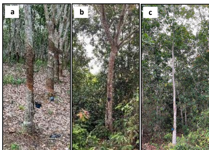
Figure 1. Well-maintained plantation (a); Shrubs rubber plantation (b); Forested rubber plantation (c).

The research was conducted at the Rubber Research Experimental Plantation, Faculty of Agriculture, Sriwijaya University, Indralaya. Ogan Ilir, South Sumatra. The rubber plantation observed was with about 14 years old plants. Weed ecosystems were selected in different plantation blocks according to weed conditions. Location coordinates based on UTM - DGN95, namely well-maintained plantation (48 S 459676 E, 9643326 N), shrubs rubber plantations (48 S 459574 E, 9642973 N) and forested rubber plantations (48 S 475149 E, 9612000 N). The research was conducted from January to July 2023 with a total of 18 weeks of observation.