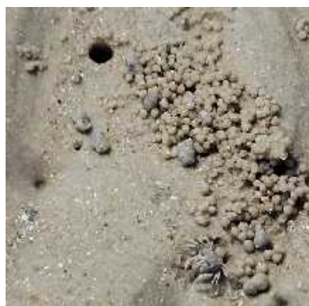
b. Scopimera crab feeding and producing sand-ball.