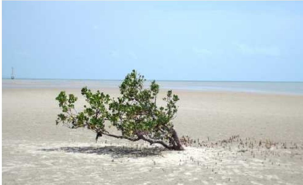
Fig. 1. Paddy Sand Beach; sand balls are emerged like paddy (rice fruit) floor along the coast.

Ecologically, coastal birds depend on intertidal area to obtain their lives. Coastal birds tend to concentrate in area, where prey are occurred. The most important food of coastal birds are crustacean, fish and mollusc . Among 214 species of coastal birds in over the world, 65 species live in Indonesia. One of them is Trinil Pantai or Actitis hypoleucos . (Arbi, 2008). Common sandpipers are migratory birds that overwinter in warmer climates throughout the Old World, specifically Africa, southern Asia, and Australia. (Malpas, et al., 2004 cit.Pines, 2011).