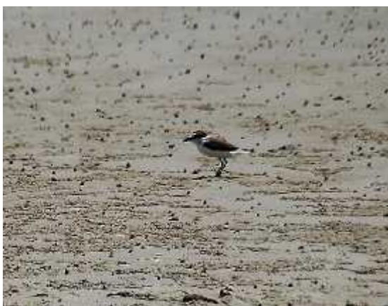
c. Acititis landing & wait, after Scopimera run into the bunker hole