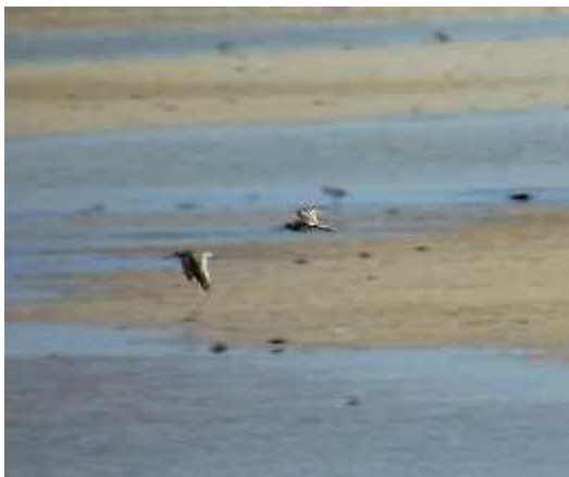
a. Acititis birds searching for food.

Pauchau and Passelic-Gerin (1988) explained the filter-feeding of Scopimera gordonae crab. The chelae spoon some surface sand into the mouth. While the spooned sand is kept floating by a water flow from the gill chambers, sideways motions of the mouth-parts succeed in sorting out organic matter and retain edible and some fine silt particles. The coarse sand is then rejected as waste pellets.