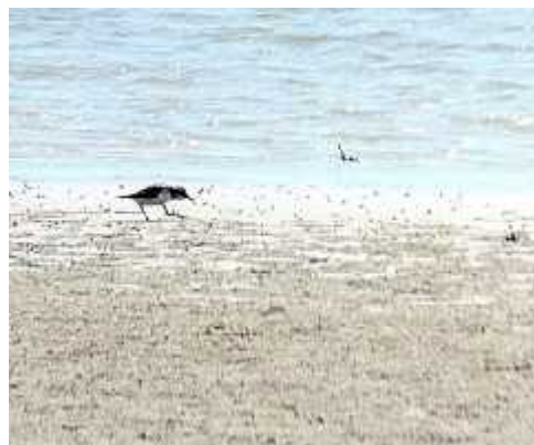
d. Scopimera come out when the dangerous moving absence. Acititis catching.